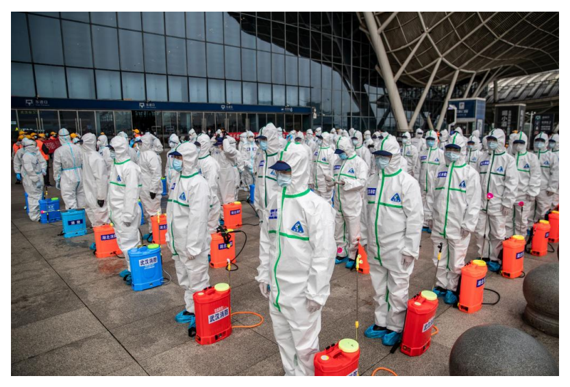
Railway workers disinfect the main station in Wuhan in March 2020

He reviewed some of the experiments and describes them as "by far the most reckless and dangerous research on coronaviruses — or indeed on any viruses — known to have been undertaken at any time in any location".