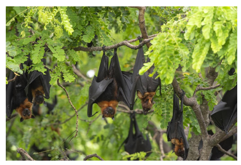
In 2012 six men who fell ill after an encounter with a large bat colony tested positive for antibodies to an unknown coronavirus