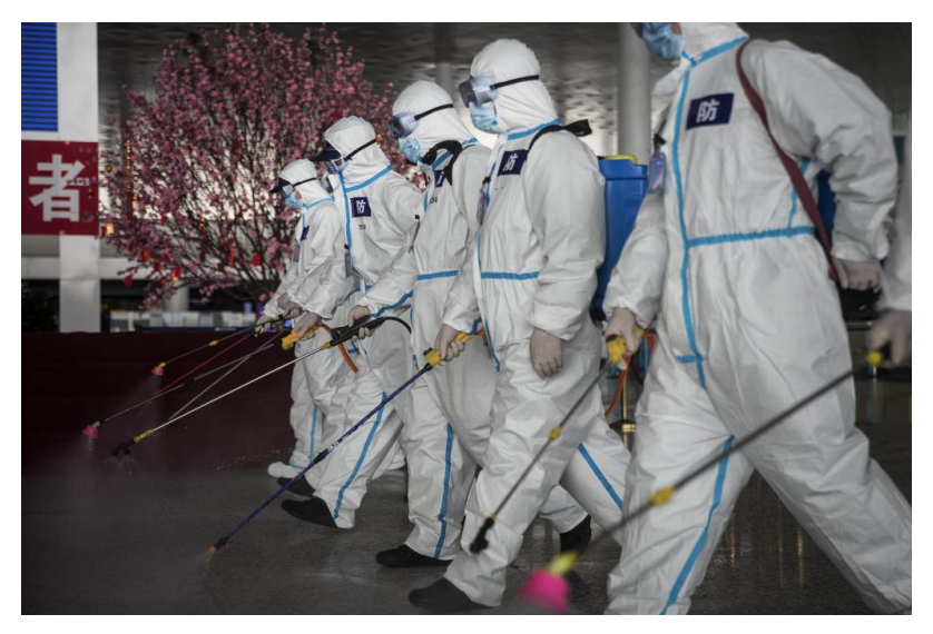
Firefighters disinfecting Wuhan airport in April 2020, after the coronavirus had gone global