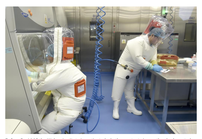
Before Covid-19 the Wuhan institute investigated whether mutant viruses they had created had the potential to spark a pandemic

The US embassy found out about the experiments in Wuhan and sent diplomats with scientific expertise to inspect the institute in January 2018, according to diplomatic cables leaked to The Washington Post. They observed "a serious shortage of appropriately trained technicians and investigators needed to safely operate this high-containment laboratory".