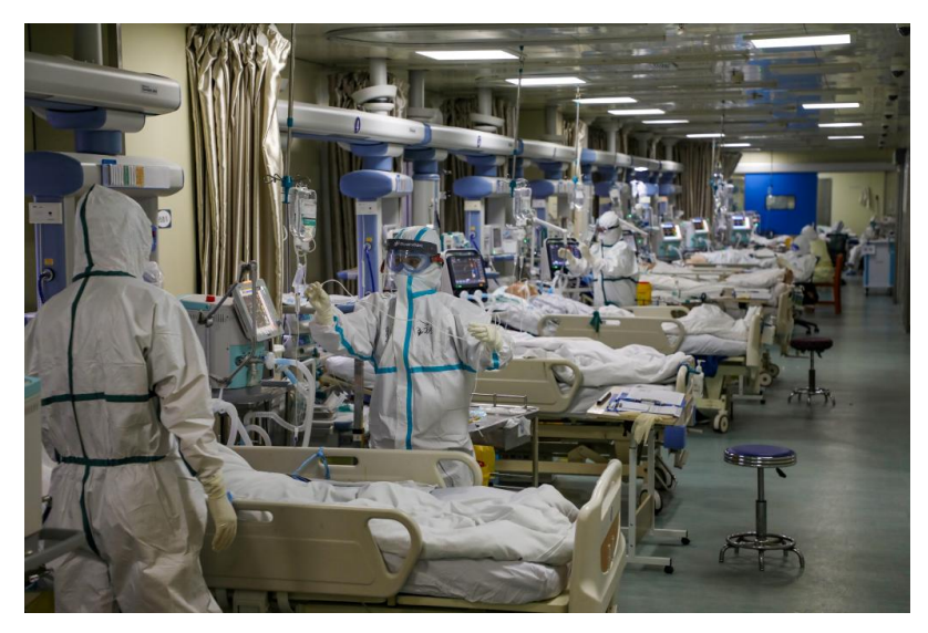
Chinese medical workers in protective suits in early February 2020

They found evidence that researchers working on these experiments were taken to hospital with Covid-like symptoms in November 2019 — a month before the West became aware of the pandemic — and one of their relatives died.