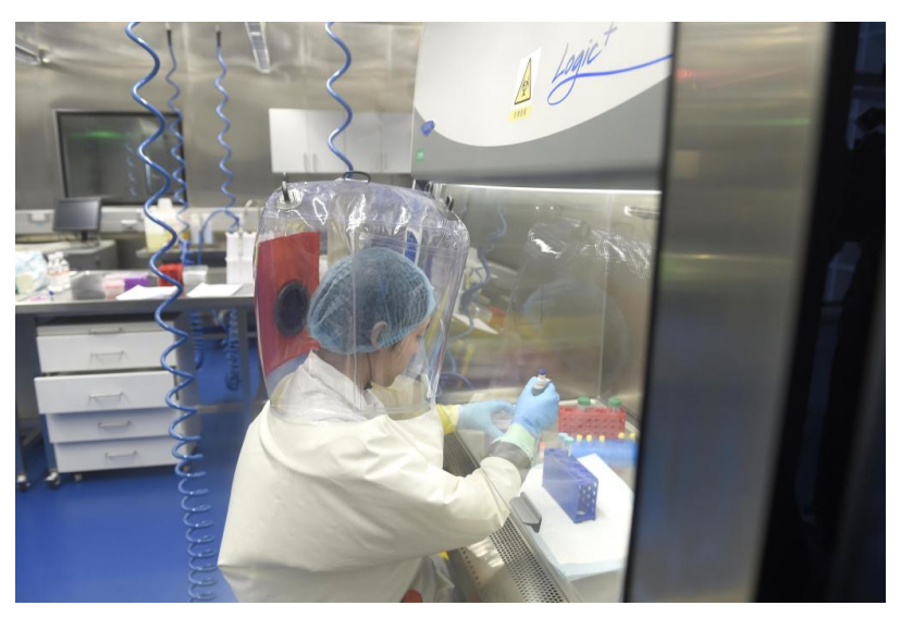
Three scientists at the Wuhan lab fell ill with a mystery virus in November 2019