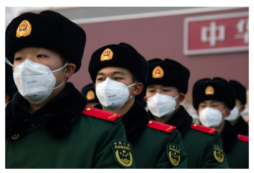
Chinese military staff were given positions of responsibility in the Wuhan institute long before Covid-19 emerged, according to a US Senate report

This explains why from the beginning of the outbreak, he says, the pandemic virus was so remarkably well adapted to infect humans.