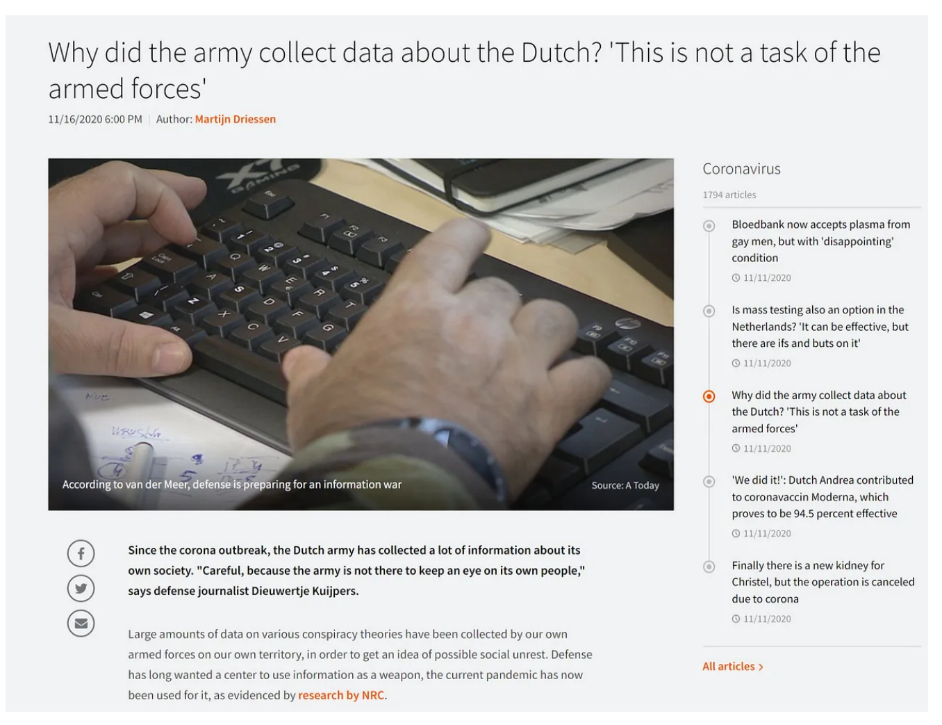
(translated from dutch via google)

don't even get me started on china or the australian reversion to prison colony.