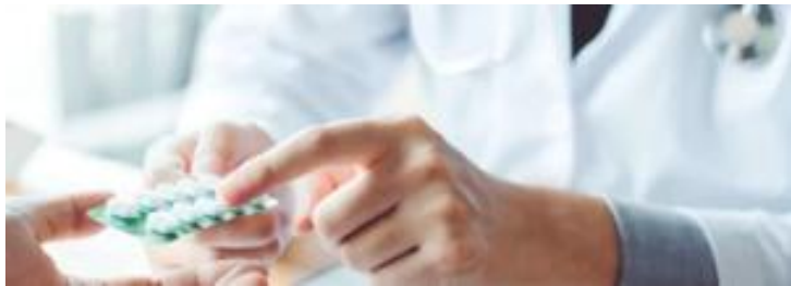
INDIA: Uttarakhand State Distributes Ivermectin to Combat COVID-19 Following Uttar Pradesh, Goa & Karnataka

You would call the drug unsafe OR ineffective. And keep people in a constant state of fear, like an abusive sociopath would do to control his victim.